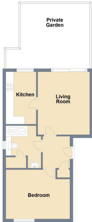
Total area: approx. 44.1 sq. metres (474.5 sq. feet)